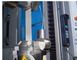
Sefar belts are designed