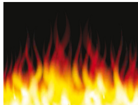
Belts from Sefar are