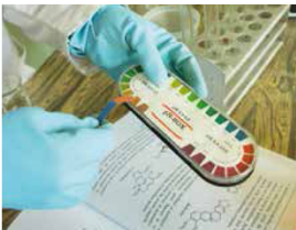
Sefar filter belts are