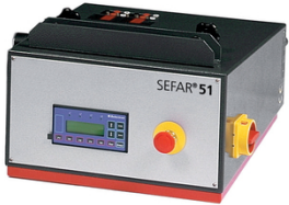
The programmable single or dual circuit electronic control unit in combination with SEFAR 3A

For pneumatic stretching systems there are two possibilities to allocate the air supply: Single or dual-circuit systems – complementary alternatives for optimal, balanced tension for all types of mesh and frame sizes. Single-circuit systems are recommended for frames having side lengths up to 150 cm. For frames having sides longer than 150 cm dual-circuit systems are recommended.