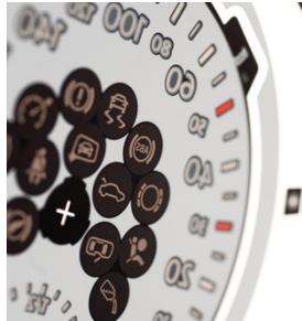
In the fast lane with the highest efficiency and quality printed with SEFAR PME