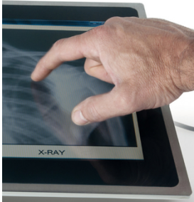
Whether edge masking or protective coatings using SEFAR PME