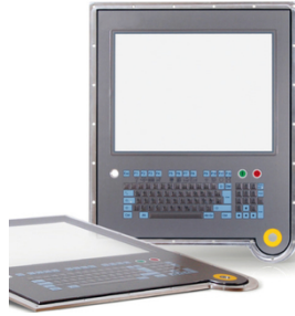
Clear and durable signs and inscriptions printed with SEFAR PME (© Danielson Europe BV)