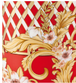
Great detail reproduction on ceramic decals (© Rosenthal) with SEFAR PET 1500