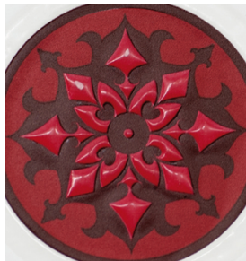
For selected clear varnish on lables, printed with SEFAR PET 1500