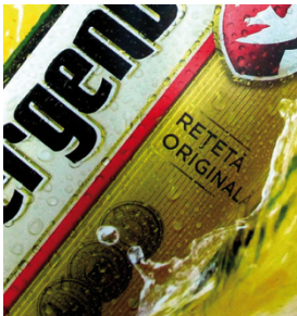
Backlit posters with halftones higher than 30 lines/cm printed with SEFAR PET 1500

SEFAR PET 1500 impresses with its performance in a wide variety of applications, ranging from graphic screen printing in small and large sizes, such as posters, displays, and signage; printing on plastics such as sporting goods, thermoformed parts, etc.; on the decoration of ceramic, directly or indirectly, and on up to textile printing and other industrial printing tasks.