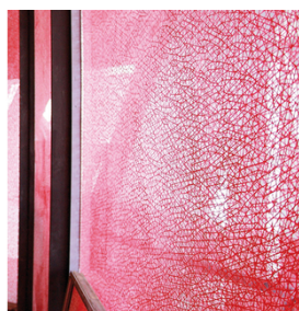
For a precise and durable print image on the glass facade with SEFAR GLASSLINE 68/175-95W