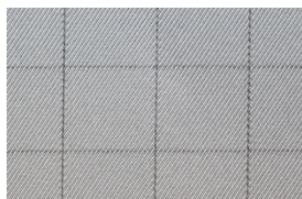
SEFAR TETEX MULTI 07-65-180 WA PHARMA