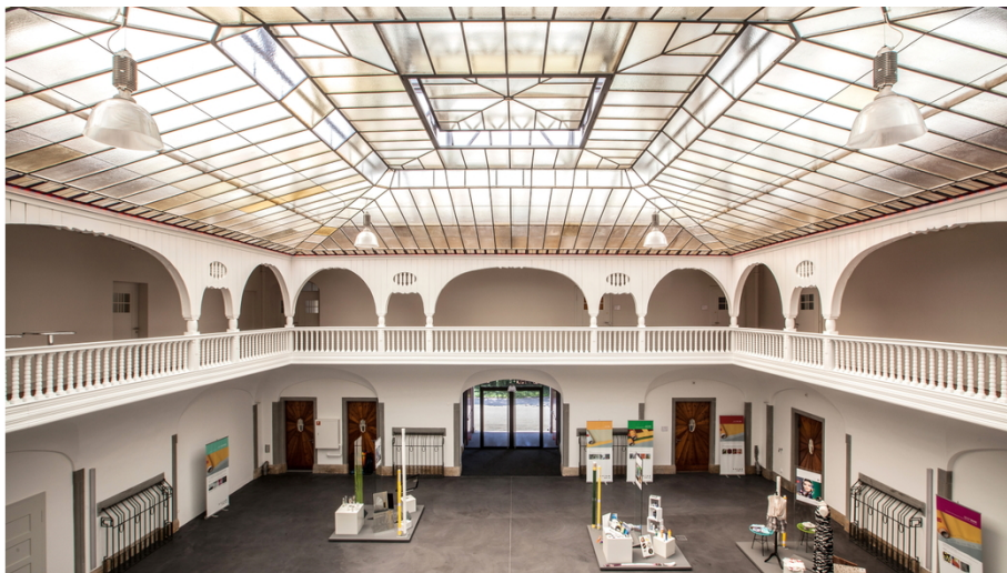
Sefar Competence & Training Center, Screen Printing

The intensive screen printing course covers a wide range of topics, from mesh selection and its impact on the print result, to the intricacies of the stretching process and how to optimize the printing process.