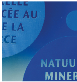
Brilliant colors and crisp print edges with UV inks. Printed with SEFAR PCF 120/305-34Y