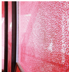
For a precise and durable print image on the glass facade with SEFAR GLASSLINE 68/175-95W