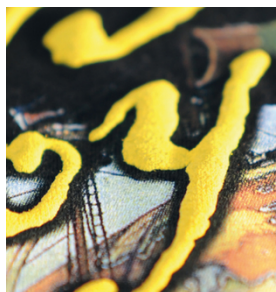
Puff ink applications on garments with SEFAR BASIC

SEFAR BASIC is designed and manufactured for t-shirts, textile and ceramic printing applications.