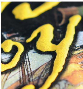
Puff ink applications on garments with SEFAR BASIC

SEFAR BASIC is designed and manufactured for t-shirts, textile and ceramic printing applications.