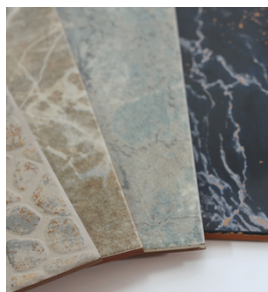
Structured and highly resistant floor tiles with SEFAR BASIC