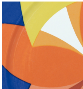
High color density on ceramics with SEFAR BASIC