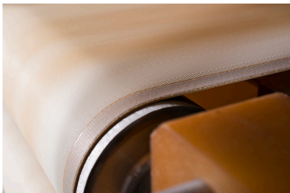
■ A new dimension in vacuum belt drying