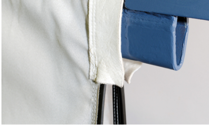
Optimal sealing design