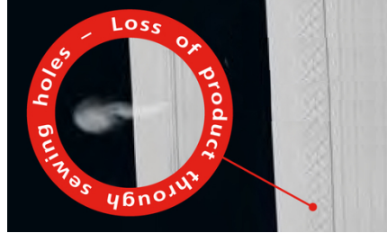
No product loss using Sefar welding technology (no sewing holes)

Sefar has developed dedicated yarns and filter media to withstand strong alkaline process conditions at operating temperatures up to 110 degrees Celsius. Our multichannel bags feature highly uniform dimensions thanks to an automated fabrication process from cutting to welding and channel sewing on a special sewing automate. Special thread is used for sewing and a highest-class fabric allows for smooth installation and perfect tightness on the collector.