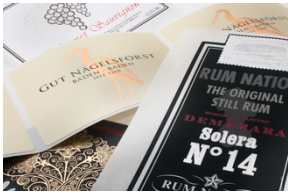
© Marbau GmbH & Co. KG