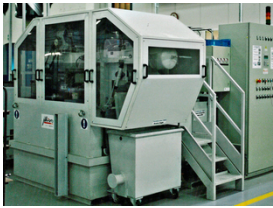
Vacuum belt filters