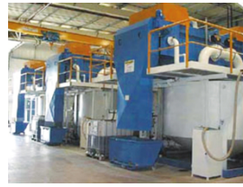
Pressure belt filters