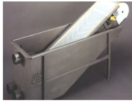
Hydrostatic belt filters